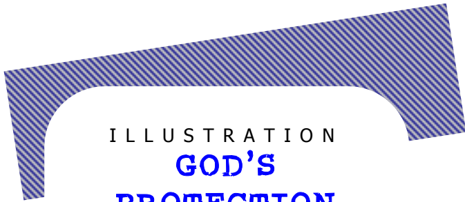
ILLUSTRATION GOD'S PROTECTION

Interject this illustration after the “Memory Verse” on page 178 of BAD TO THE BONE