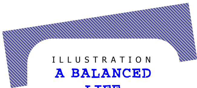
ILLUSTRATION A BALANCED LIFE

Interject this illustration after the third paragraph on page 179 of BAD TO THE BONE